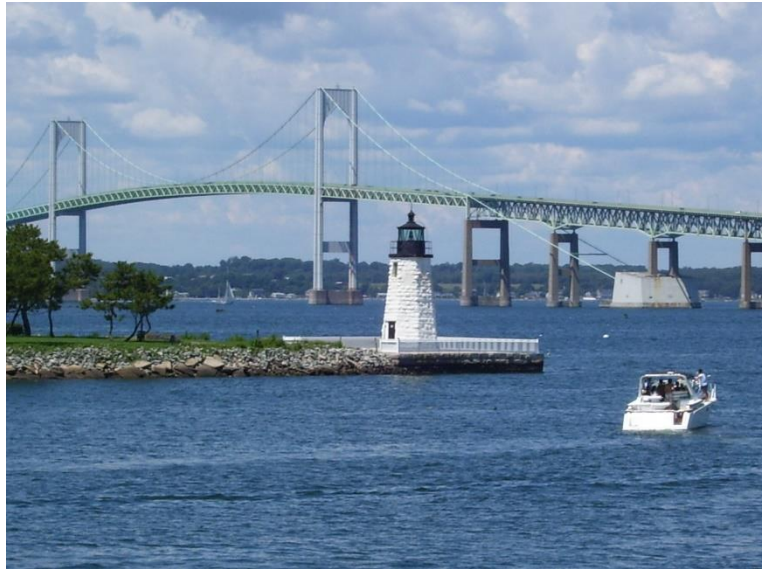
Newport, Rhode Island Goat Island Lighthouse