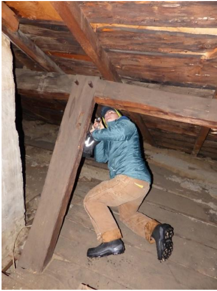
On April 1st, 100 timber framers from the Timber Framers Guild explored the upstairs & downstairs of Parsons House on a field trip scheduled during their annual meeting. The members of the guild were from across the