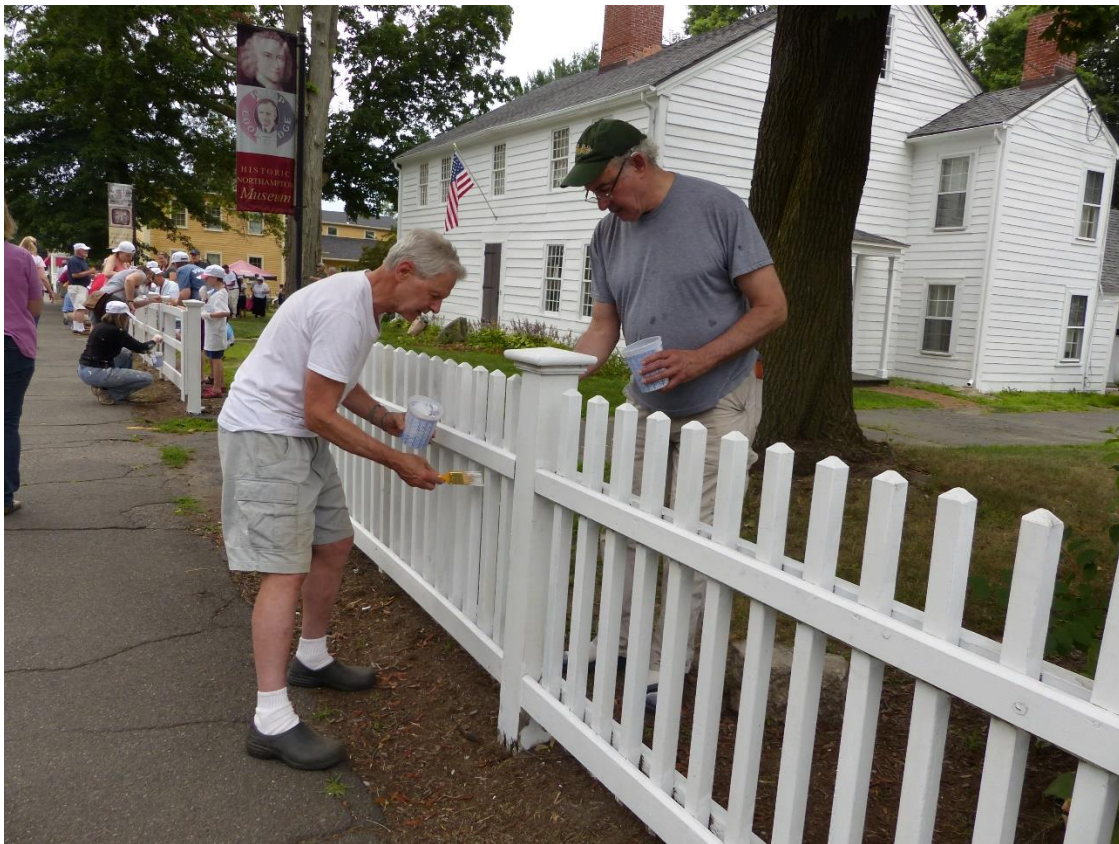
Hours after the Parsons Family Reunion, more than 100 volunteers arrived and painted all 300 feet of fence out front in less than an hour. The project, Good Neighbors Paint Good Fences, raised more than $10,000, which is being used to purchase shutters for the Damon House (where the picnic was held). The excavation made front page news in the Daily Hampshire Gazette.