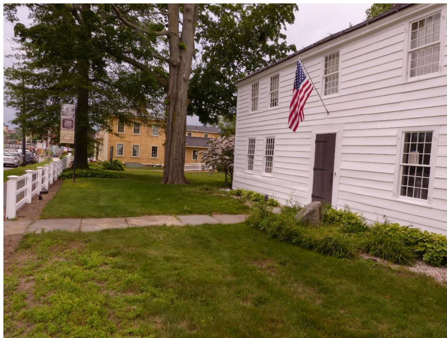
Parsons House painted in 2017:

In June and July, a team of painters from Northeast Paint spent a week washing, prepping and painting the Parsons House. As part of this work, window mullions were also repaired. After the painters finished, we installed all new gutters on the Parsons House. The freshly painted house & a new flag out front.