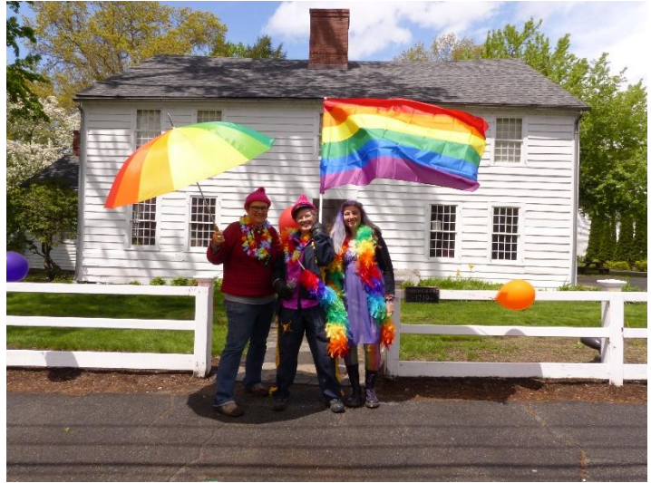
During its nearly 300 year history, the Parsons House has witnessed lots of comings and goings--from stage coaches & Shay's Rebellion to Northampton's annual Pride March.